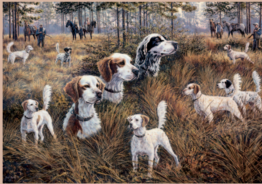
"Legacy of the Smith Setter Champions"