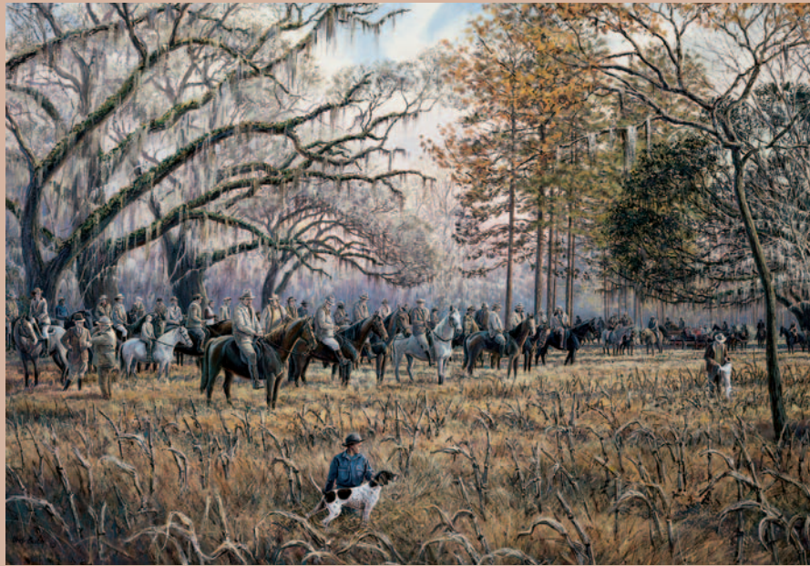
"Breakaway at Dixie"