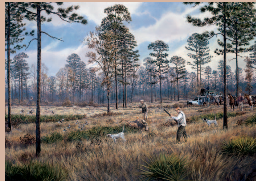
"Shooting at Chinquapin"